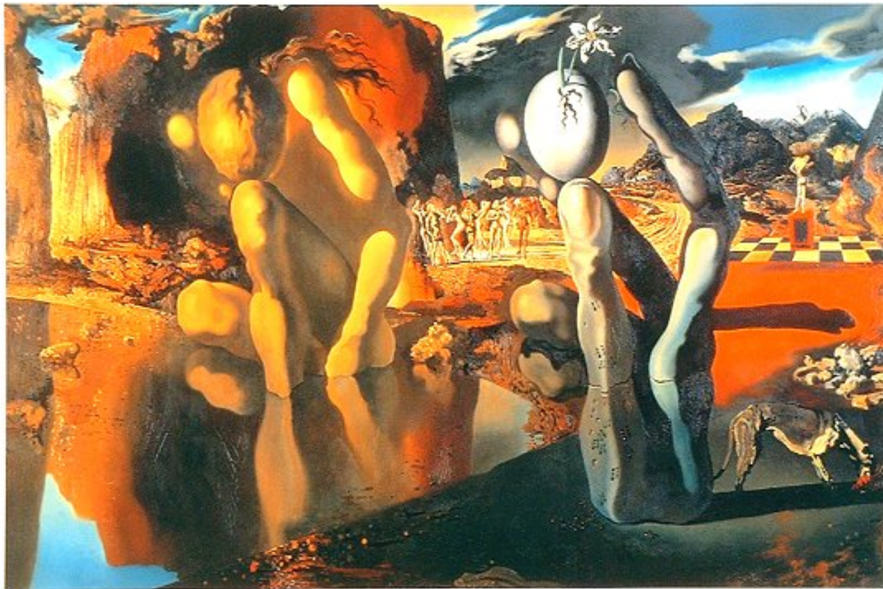
Metamorphosis of Narcissus SALVADOR DALÍ □